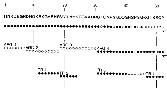
Fig.1. Amino acid sequence of the predominant basic protein in human seminal plasma. The sequence is presented in the standard IUPAC, one-letter code for amino acid residues. The numbering of tryptic fragments (TR1–TR4) and the numbering of fragments of lysine-blocked protein (ARG1–ARG4) are explained in fig.2. (●) Residues identified by sequenator analysis; (○) residues not identified by sequenator analysis; (←) residues identified by carboxypeptidase Y digestion.

Tryptic fragments were purified by RPC (fig.2a). Fragments TR0–TR4 were hydrolysed and amino acid analysis showed an equal molar yield for all fragments (65% of theoretical yield).